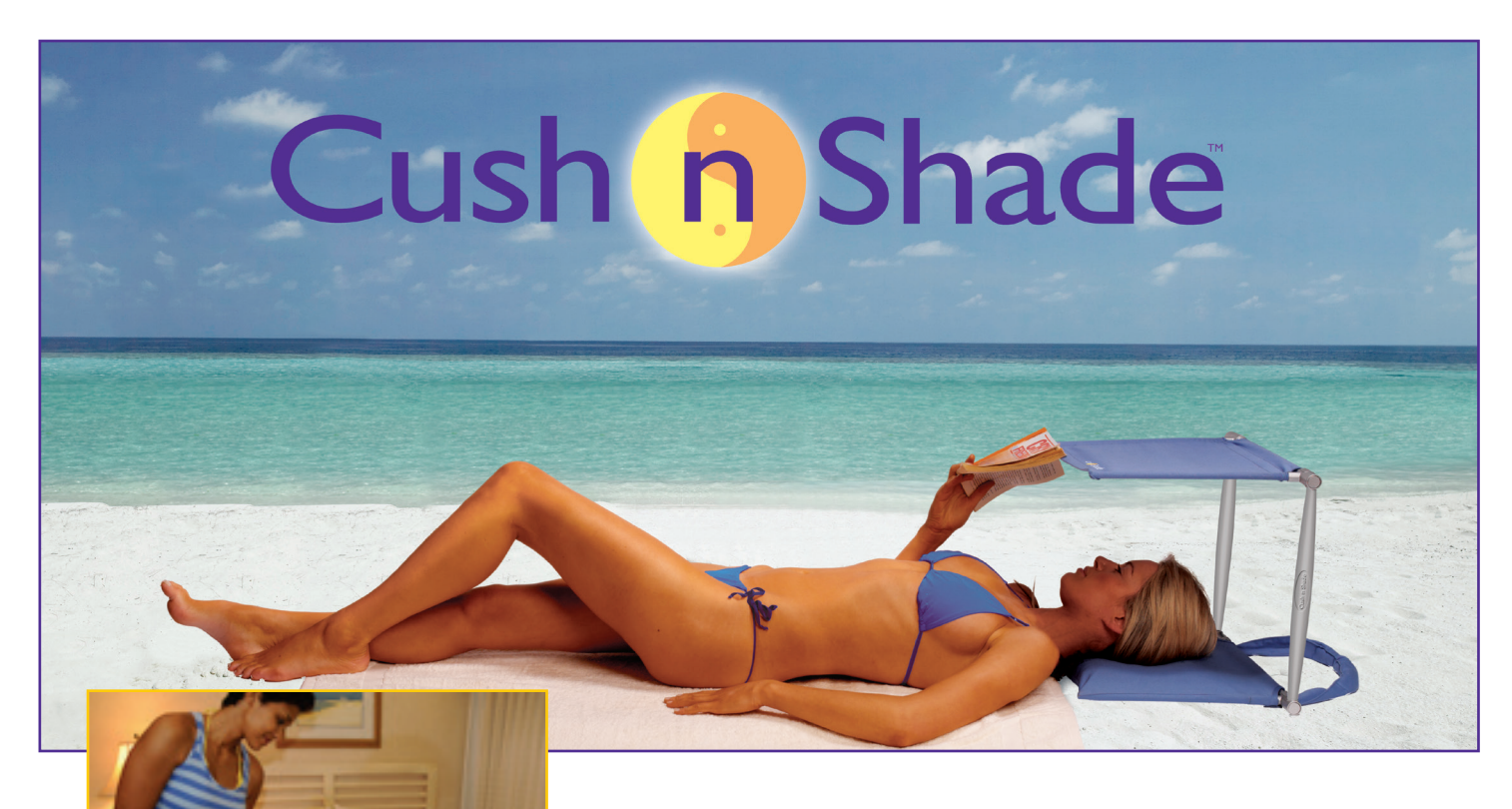
Serving Hotels & Resorts, Cruise Lines, and Tropical Retail Stores!